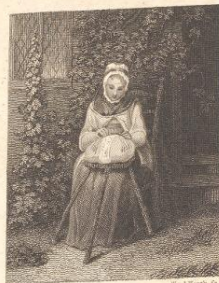
The Cottager wife waiting at her own door.