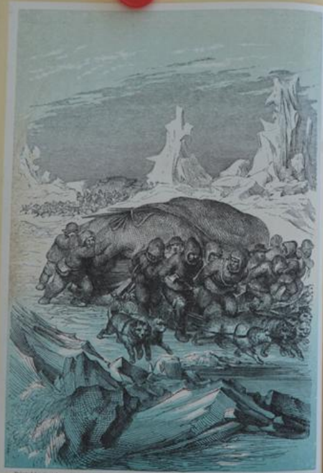
Printed by R. and W. Baynes and Co., 15, Abchurch Lane, London, E.C. 4.