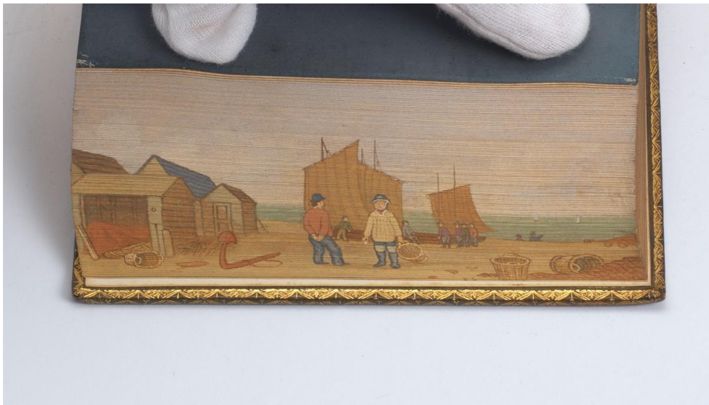
Table Talk, and Other Poems.