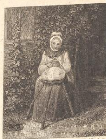
See Cowper's wife seated at her own door.