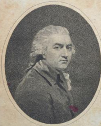
PETER PINDAR ESQ r