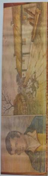
A fore-edge painting on a copy of Robert Burns's Poems : one section shows a rural landscape near the Burns cottage at Alloway, the other a portrait of Burns. (See the description of this book on page 85.)