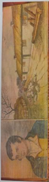
A fore-edge painting on a copy of Robert Burns's Poems : one section shows a rural landscape near the Burns cottage at Alloway; the other a portrait of Burns. (See the description of this book on page 85.)